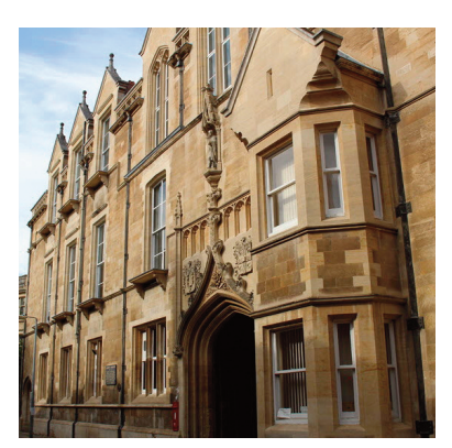
Figure 2: The Old Cavendish Laboratory, courtesy of the James Clerk Maxwell Foundation